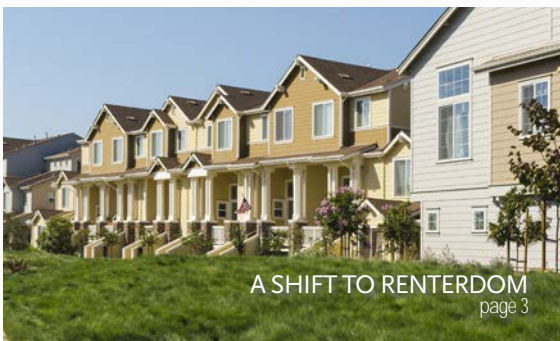
A SHIFT TO RENTERDOM page 3

COMMUNITY PARTNER SPOTLIGHT: AVANATH+COR-CDC page 2