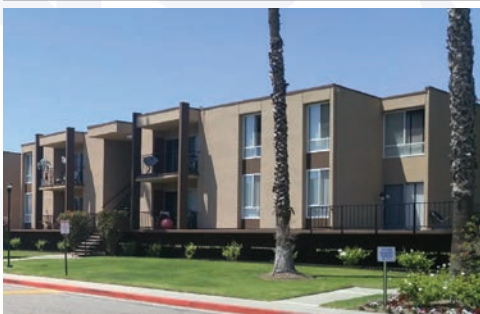
Northpointe is a 528-unit multifamily property located in a ethnically diverse, working class neighborhood of Long Beach, California.